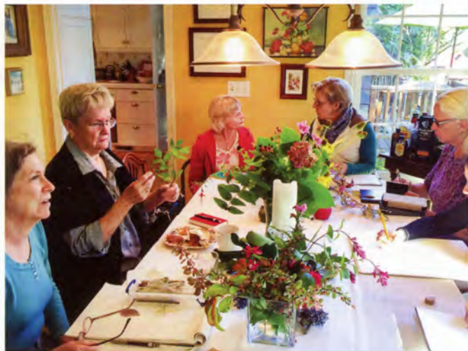
Members of OBA gather to discuss the finer points of the sketchbook exchange. An informal setting fosters camaraderie and creativity.

As we admired the beautiful line of artwork unfurled across the table from the opened accordion sketchbooks at our monthly meetings, we quickly recognized the unique advantages of this